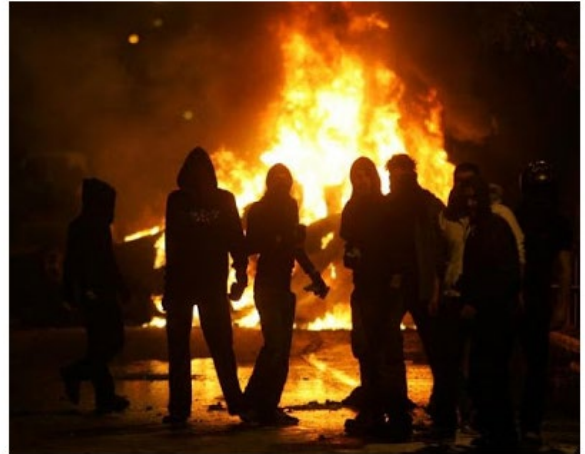
Στη φωτογραφία, μέλη της ΚΙΣΑ διαμαρτύρονται για τις ναζιστικές εκδηλώσεις ενάντια στην κατοχή